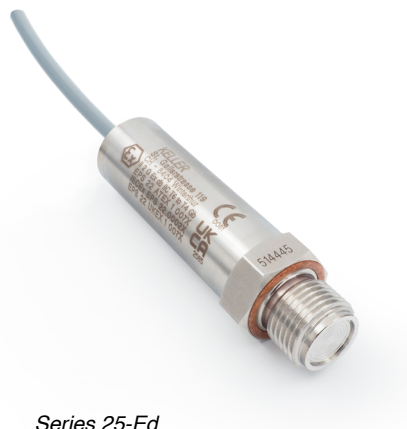
Series 25-Ed Series 35X-Ed