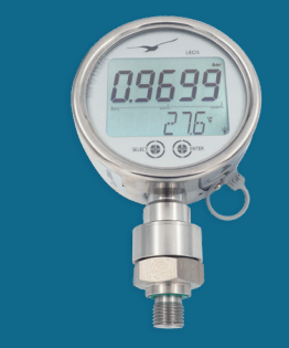
Digital Pressure Gauges

Submersible probes for level and fill measurement. With a special design and materials including cables and housings chosen for their compatibility with their surroundings, these probes can be used in a wide range of liquids.